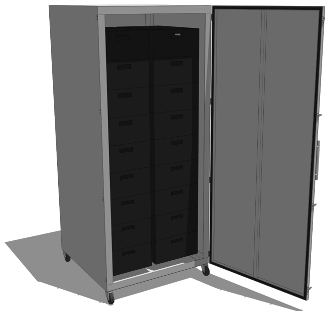
CūrPod SpaceSavr showing RPC Stacks & Hinged Door Seal