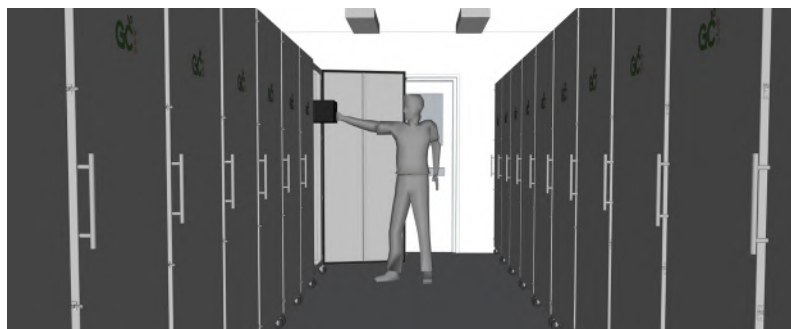
CūrPod SpaceSavr Array in Narrow Dry Room