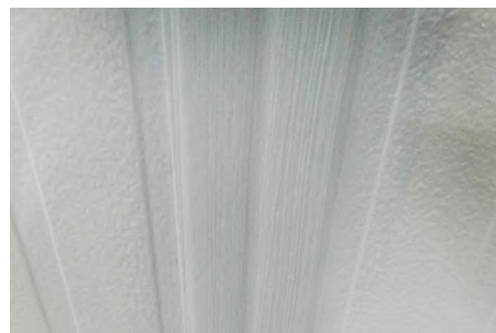
gcfiller seam paint

GC has world-wide partnerships bringing exclusive, European-proven products and techniques to panel construction. The deliberate process of using GC StickyFleece and GCFiller to finish rooms proves a Cornell University Water Column pressure test and ensures gastightness. The “bubble-tight” goal also offers energy savings in the world of GCPA grow rooms.