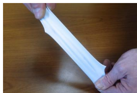
gcfiller seam paint

Proper installation following approved practices will create a vapor barrier built-in to the panel wall system. Since an additional vapor barrier is not required, savings are found in the reduction of material and labor costs. Humid climates make this imperative to achieving low relative humidity, especially late in the flower cycle.