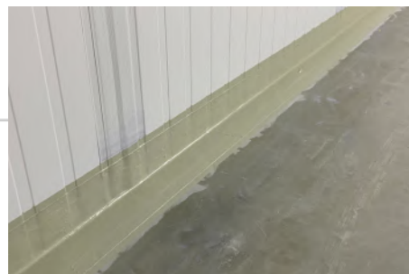
gcfiller wall/floor joint seal

Panels are tested in accordance with UL, ULC, FM and ASTM approval standards, testing methods and procedures. Panels received a Class 1 classification rating of insulated wall & ceiling panels to unlimited height without sprinkler protection. Available Kynar and CleanSafe finish options afford the option of increased durability in high-use areas.